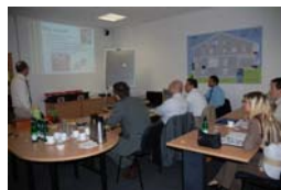
A training course in action

Contact the Export department to register yourself.